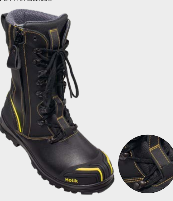
LESNA GII PU/PTFE+Chainsaw